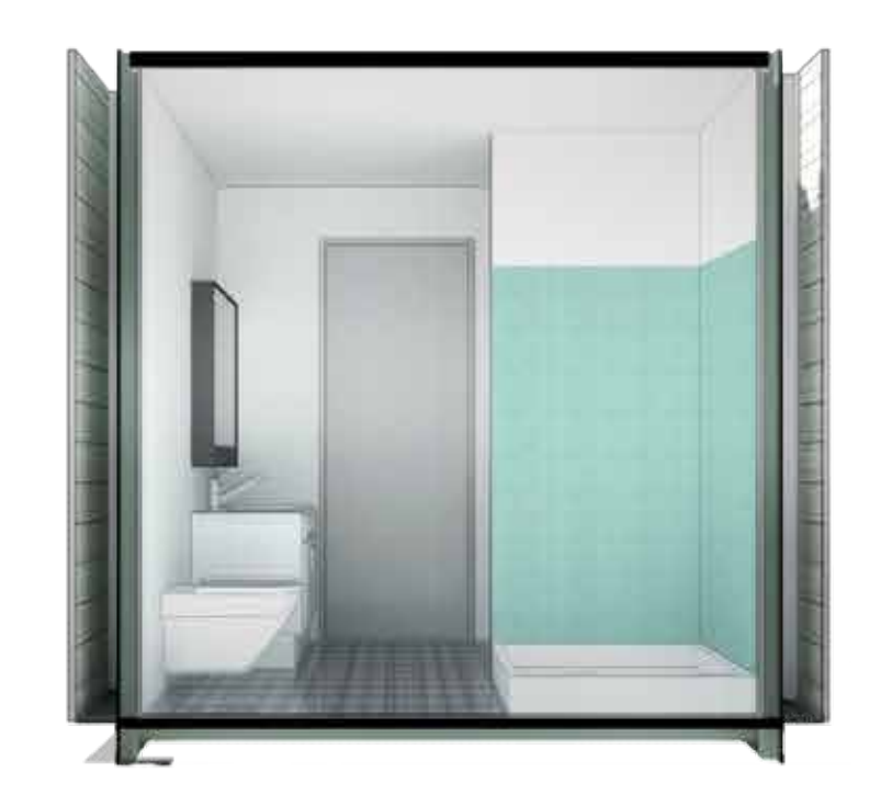
Bathroom side view