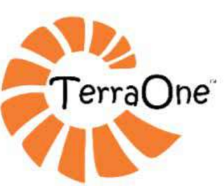
TerraOne Corporation A 501(c)(3) non-profit organization TerraOne.org